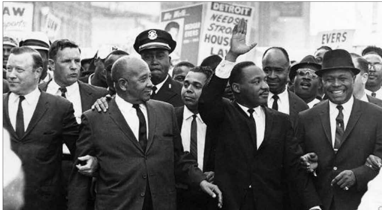
Rev. Martin Luther King, Jr. marches down Woodward Ave. during the Walk to Freedom on June 23, 1963.