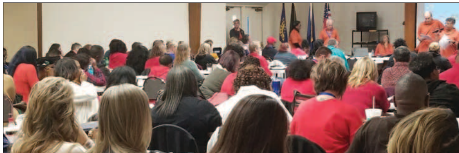
EAP and Benefits contract update