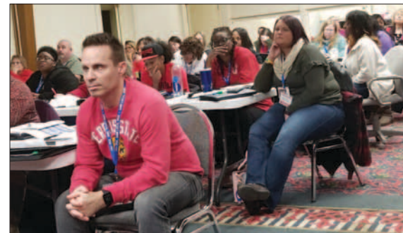
Stewards listen attentively to CBA changes.