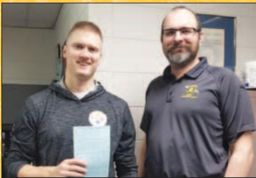
MSP Welcomes New Member ..... 5