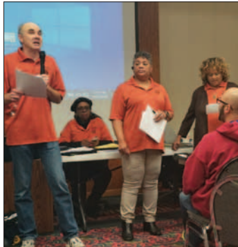
Staff goes over CBA Articles.

The primary CBA and secondary agreements will be soon mailed to all members. If there are any questions, reach out to your worksite Stewards for advice on filing grievances and any contract violation issues. If you need assistance in determining who your worksite Steward is, please contact Local 6000 at 800-243-1985.