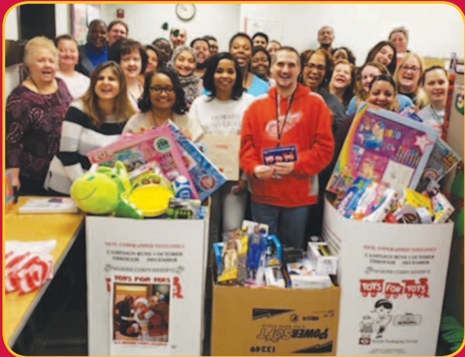
Members at DHHS Warren, Macomb County