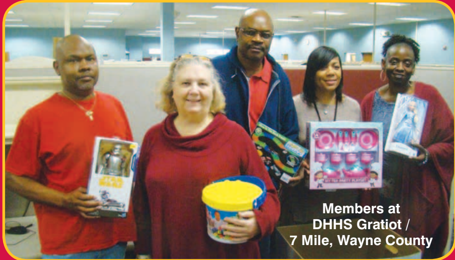
Members at DHHS Gratiot / 7 Mile, Wayne County