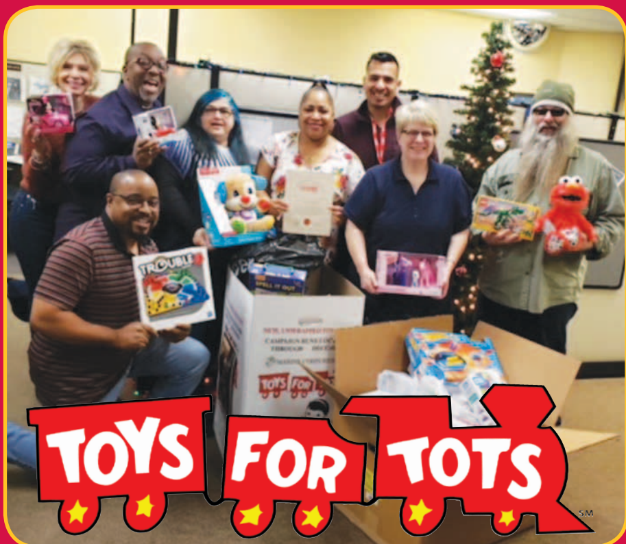
Members DOC Tether Unit Lansing, Ingham County