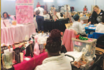
Gratiot / 7 Mile Holiday Bazaar ..... 6-7