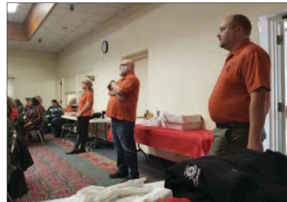
Local Reps assist in Q&A.