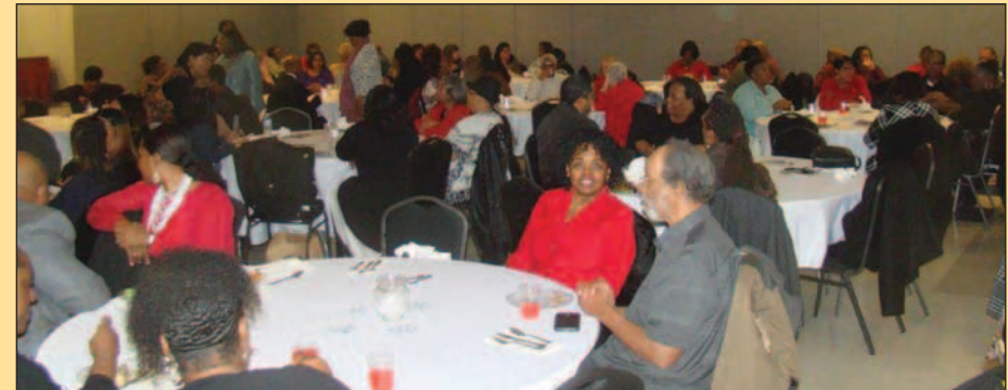
Members enjoying the Holiday Party