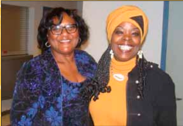
District 1A-2 Holiday Party ..... 7