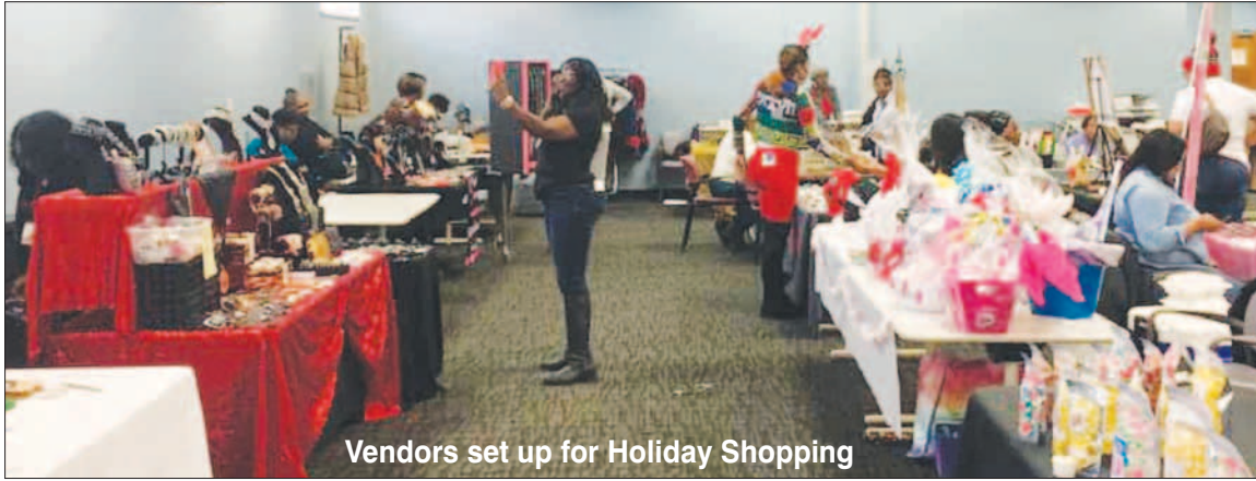
Vendors set up for Holiday Shopping

It was a wonderful opportunity to see our membership in a different light. We have a wealth of talent within Local 6000, and it was my pleasure to participate in this event.