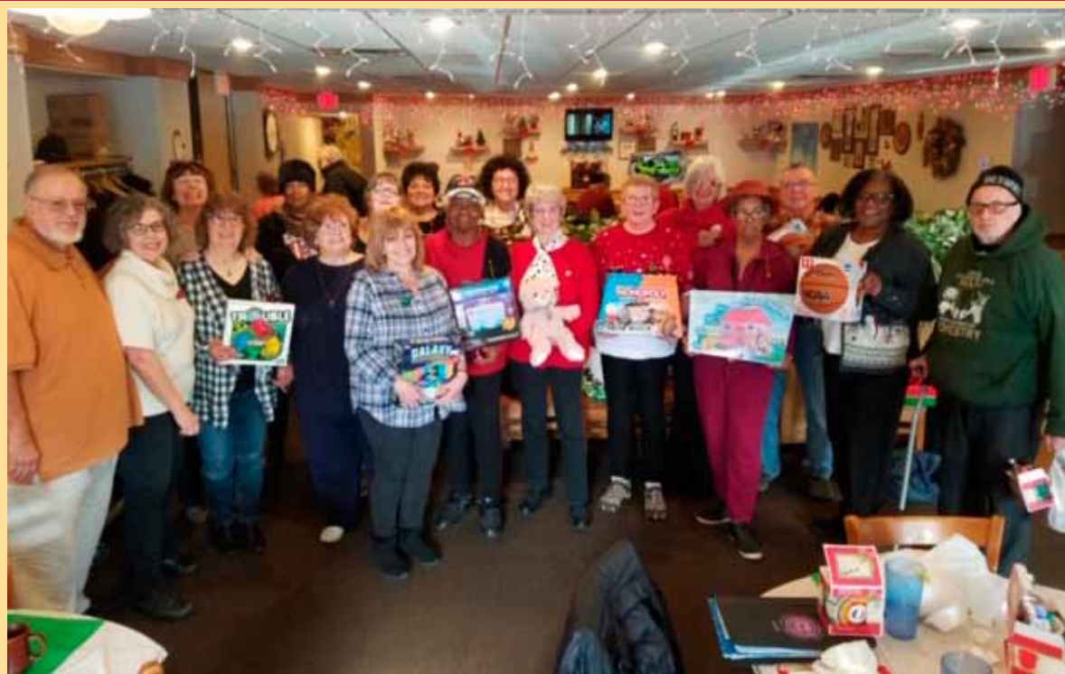
UAW Local 6000 Statewide Workers Chapter with Toys for Tots donations.